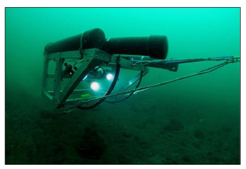
Figure 2: DDV recording epibenthos (Sheehan et al., 2013).